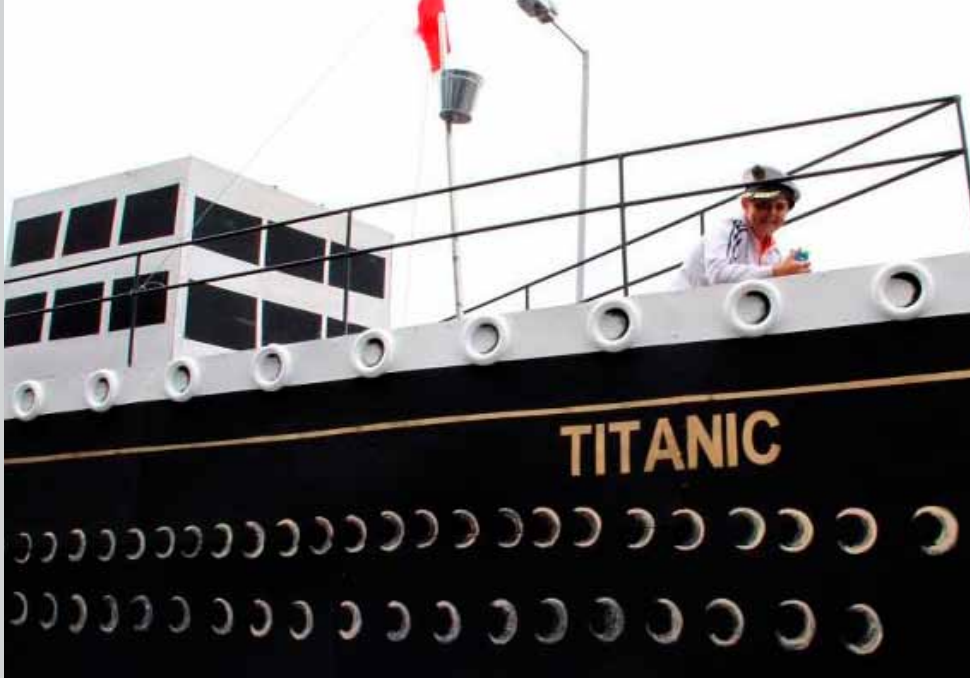
The RMS Titanic Float, sponsored by Belfast Harbour, on parade during the Féile carnival parade

Part of our 2011 Corporate Responsibility programme saw Belfast Harbour provide core financial support for Feile Belfast's staging of the 'Féile an Phobail' (Festival of the People) during the summer.