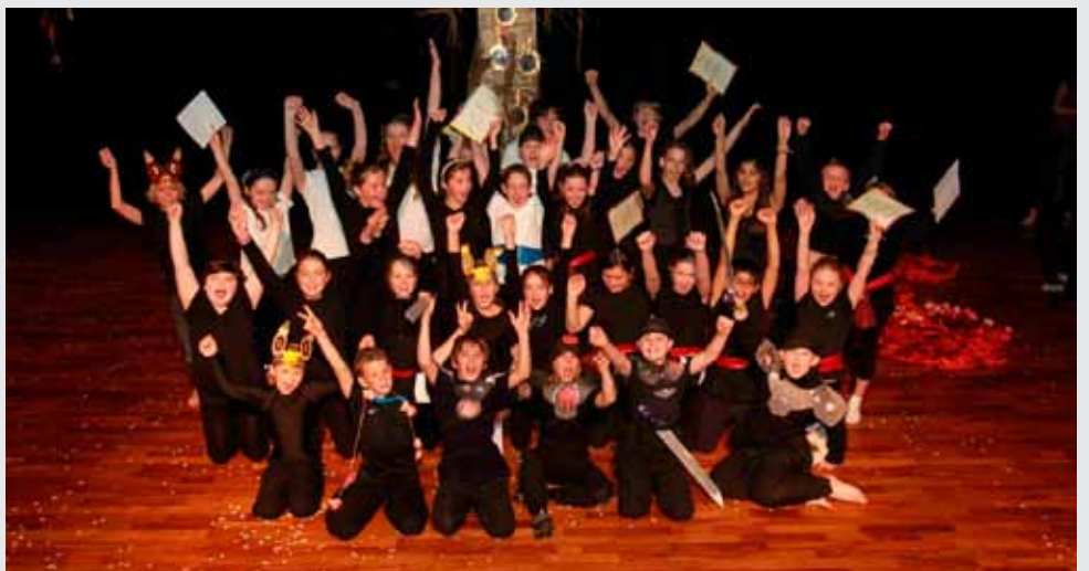
The images above show the Lyric Theatre's Summer Outreach Programme participants in full flow.