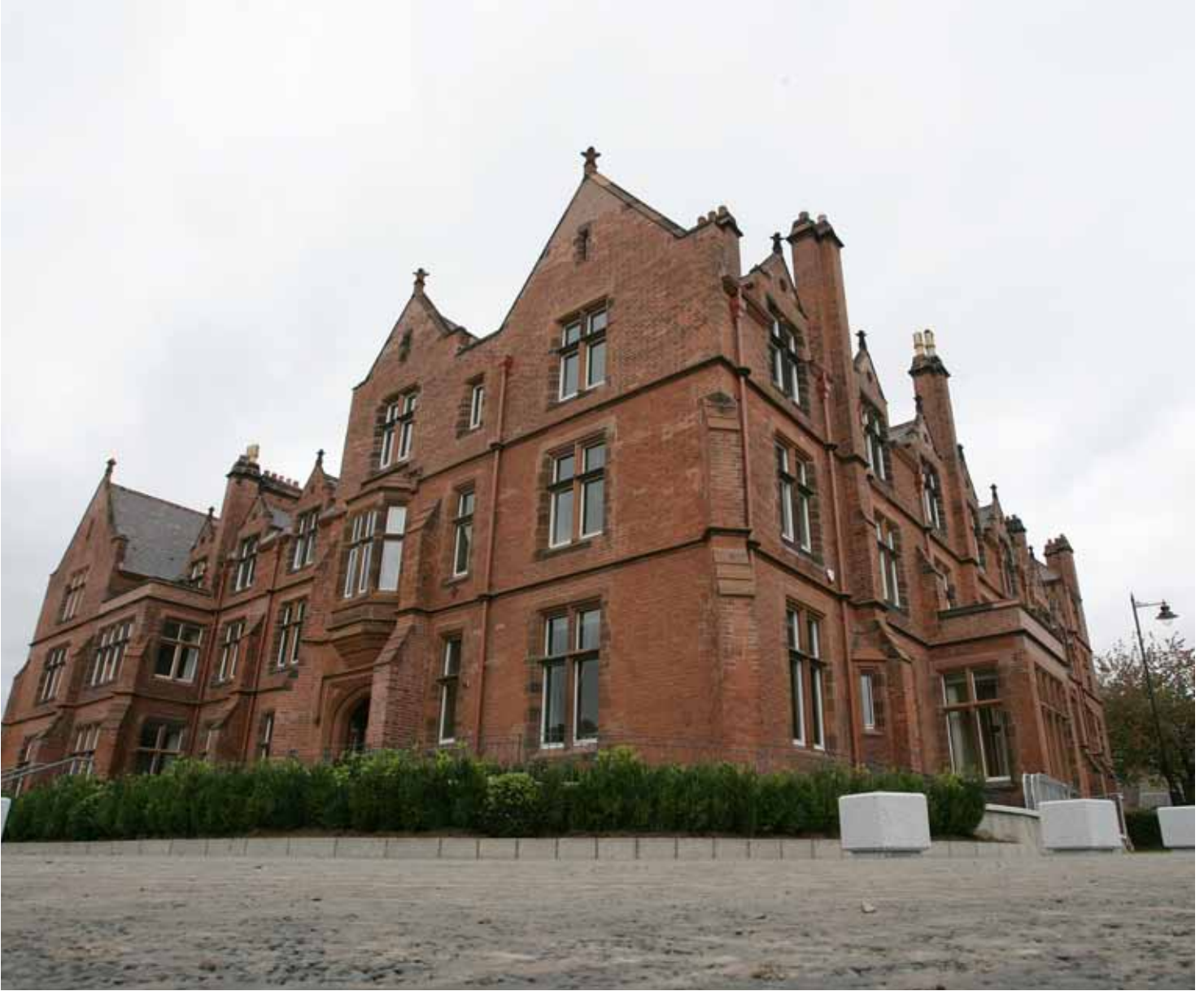
Postgraduate and Executive Education Centre at Riddel Hall