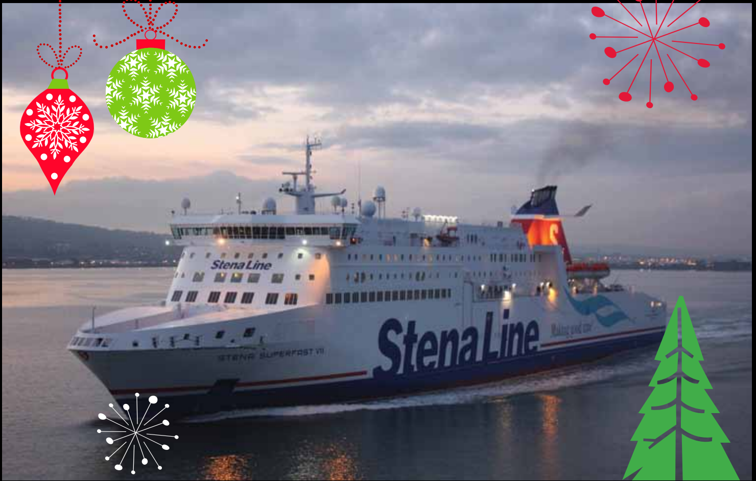
Stena Line's Superfast VII