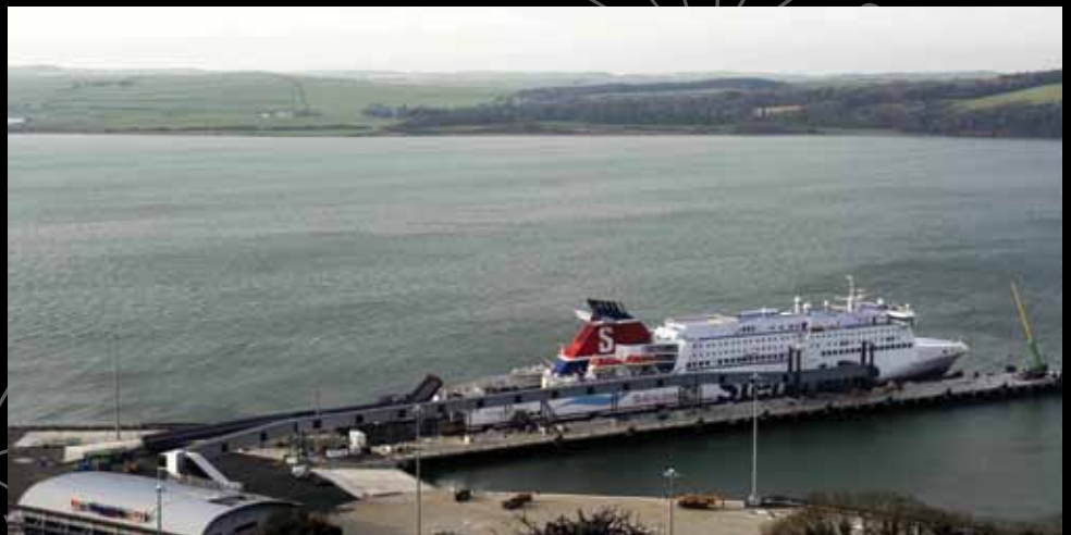
Stena Line's Superfast VII docked at the £80m Loch Ryan Port and terminal facility

Scheduled sailings from the new Loch Ryan Port began on Monday 21st November 2011.