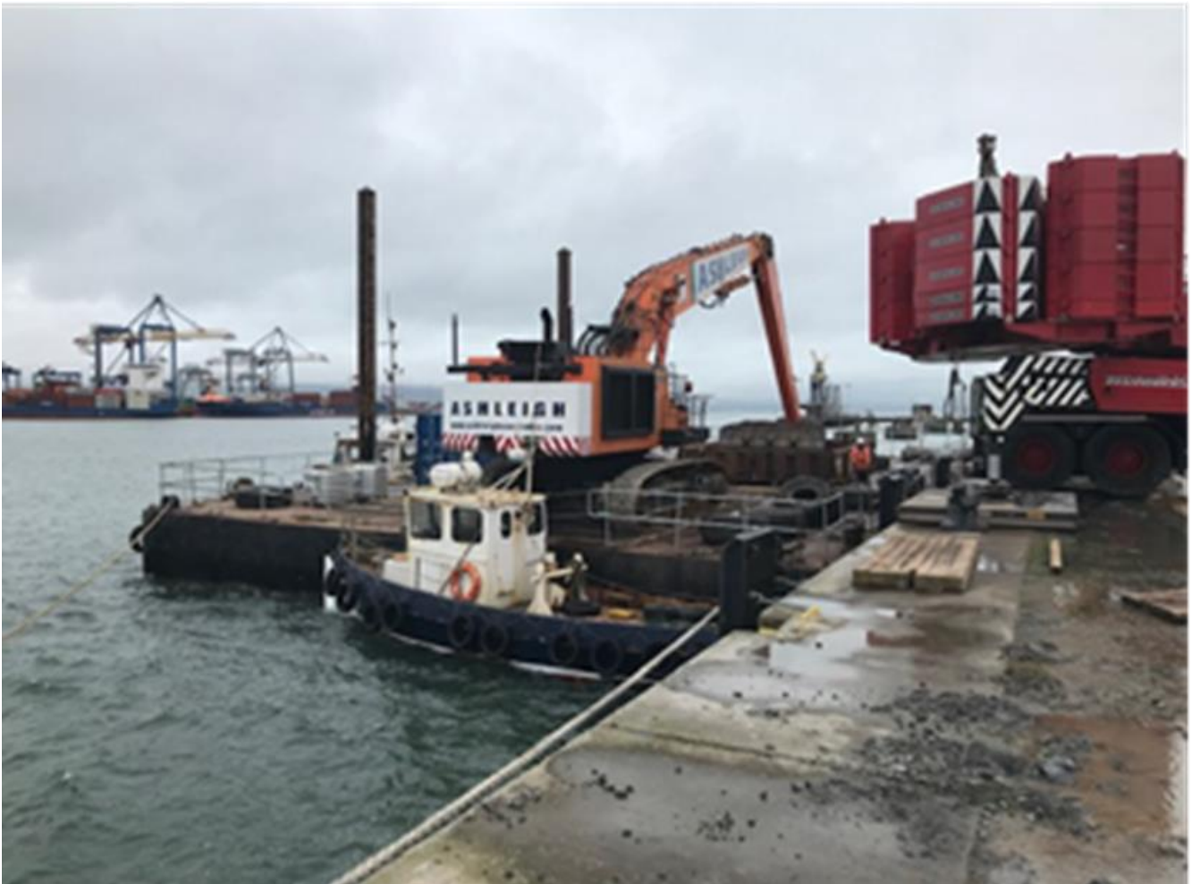
Figure 1 - Tug and Barge

All vessels are to keep well clear and pass at an appropriate speed to minimise wake. Vessels bound for VT4N will be provided with a positive report from Belfast VTS when the tug and barge are clear of the berth. This notice remains in force until cancelled.