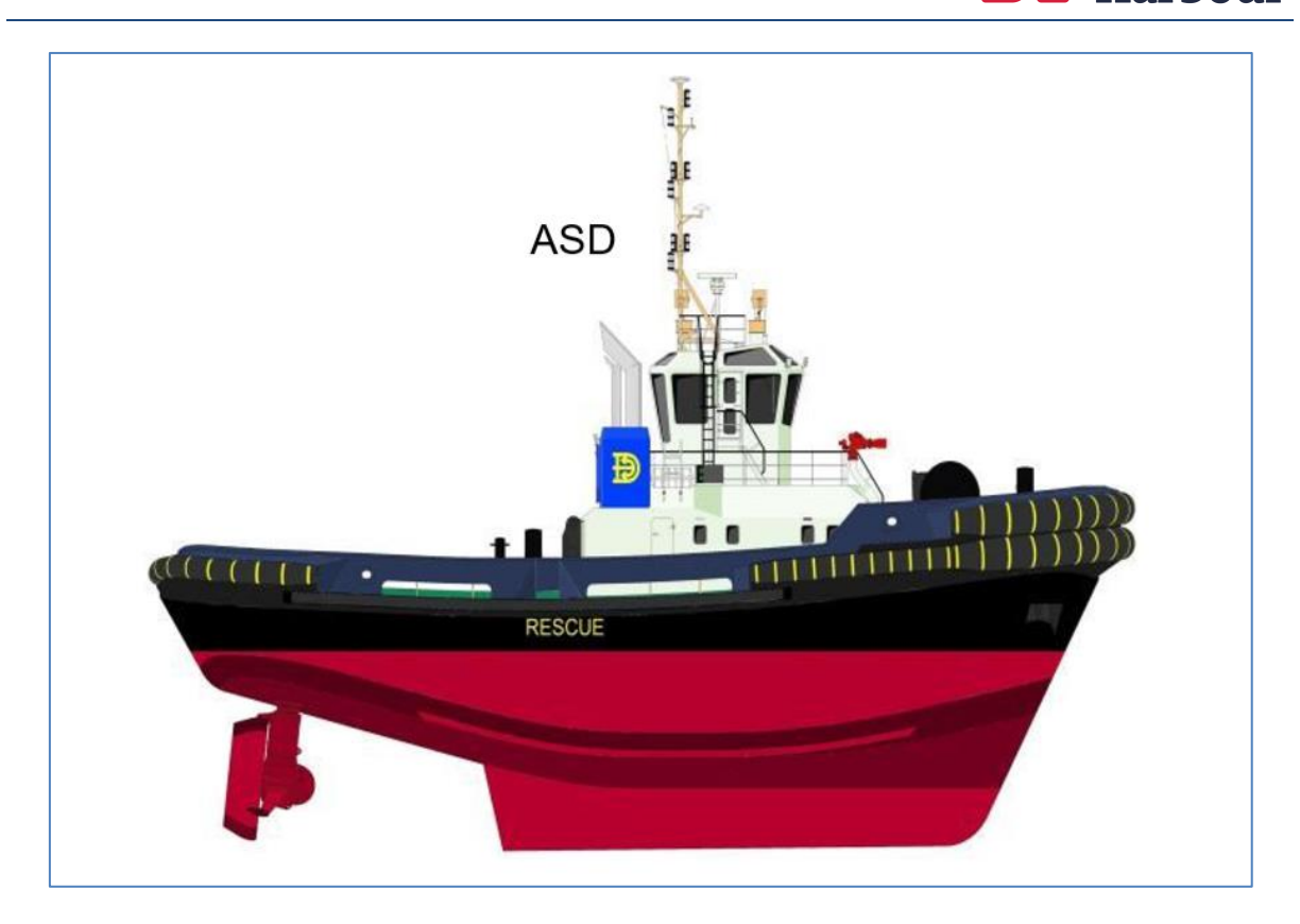
Figure 2: Azimuth Stern Drive.