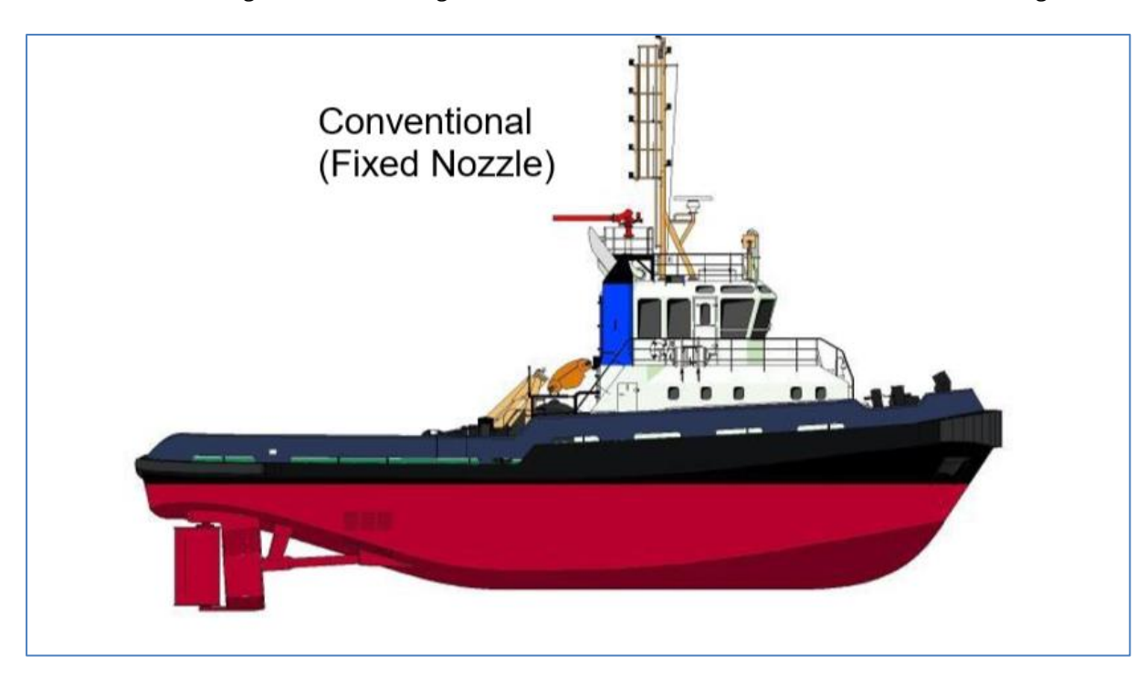
Figure 3: Conventional Tug

manoeuvrability, conventional screw tugs may be fitted with a steerable nozzle, a bow thruster or a retractable azimuthing bow thruster. Tugs fitted with the latter device are referred to as "Combi-Tugs".