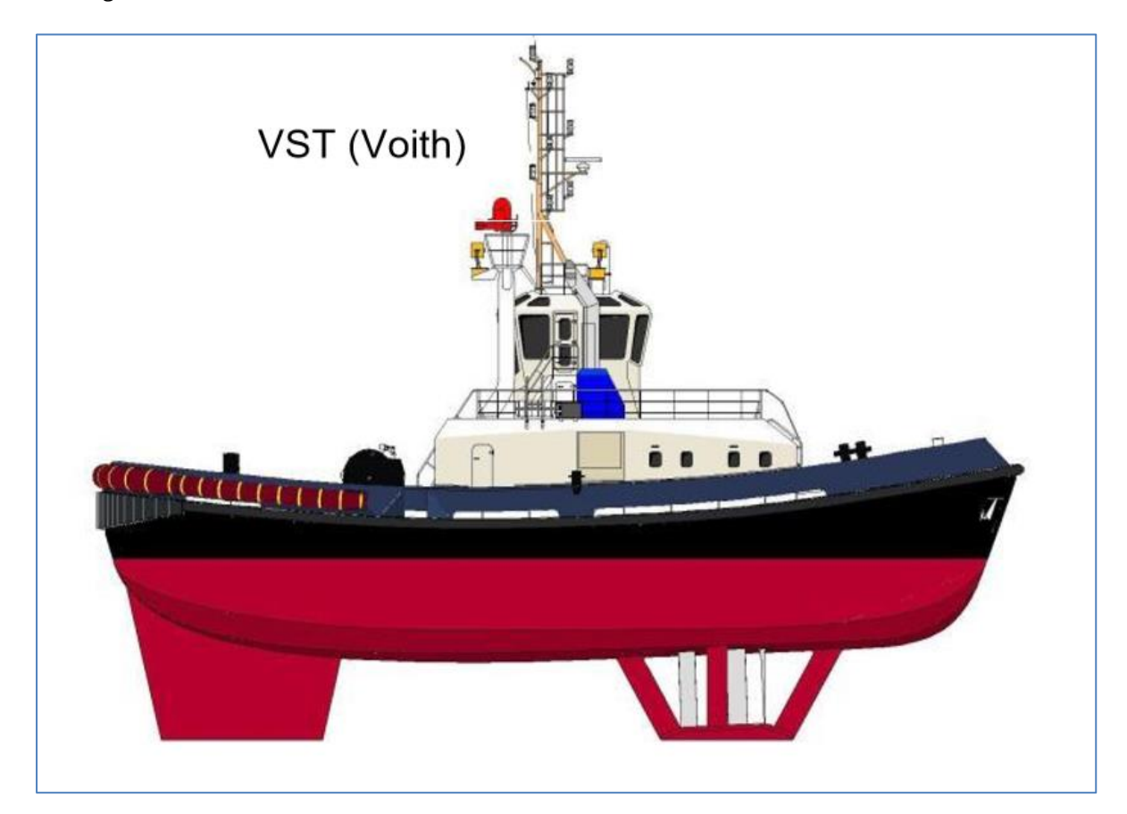
Figure 1: Voith Schneider

The Voith-Schneider Tractor Tug (employing Voith-Schneider cycloidal propellers) as shown below in Figure 1 was introduced for ship-handling due to its exceptional manoeuvrability and ability to rapidly change heading.