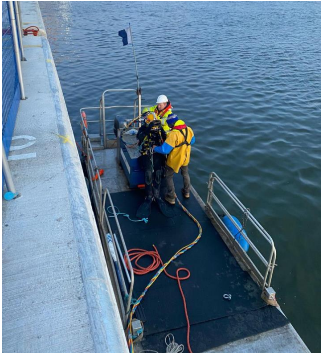
Figure 3: "Marine Worker" dive pontoon