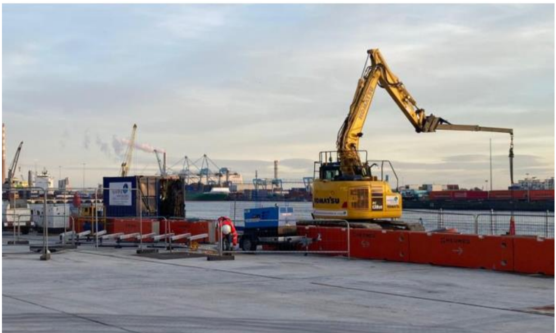
Figure 2: Komatsu 318 excavator